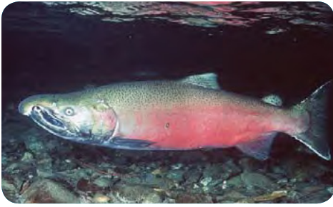
Coho Salmon in the Klamath Basin

(Credit: Klamath Dam Removal Overview, Report for the Secretary of the Interior, 2013)