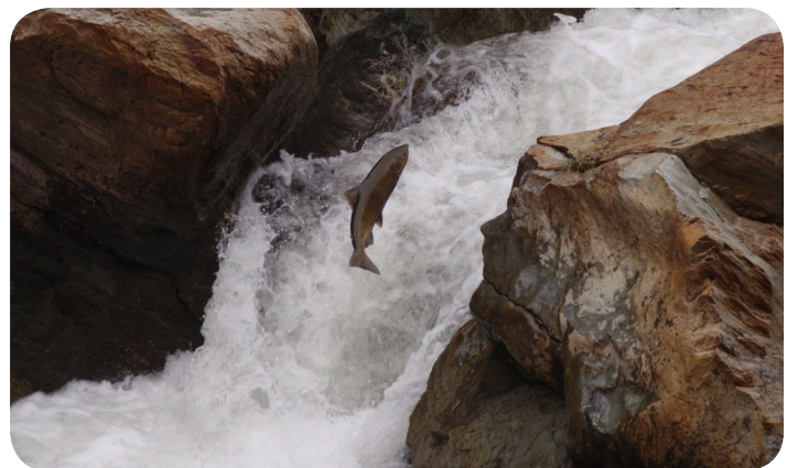
Chinook, Klamath River