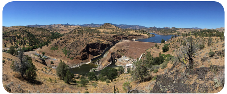
Iron Gate Dam

KRRC's work is part of a cooperative effort to re-establish the natural vitality of the Klamath River so that it can support all communities in the basin.